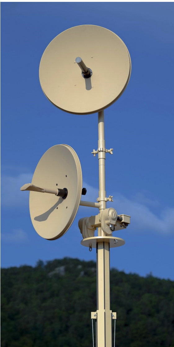
Comrod TM series telescopic CAPAS-MC mast with CAPAS-DR Dual Rotator and Band 4 Dishes

Upon deployment network data can be digitally disseminated to the tactical communication nodes, where the CAPAS™ alignment systems accurately direct the antennas for optimal performance — in a matter of seconds!