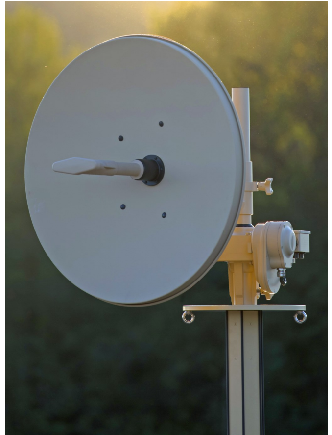
CAPAS -SR rotator with Comrod band 3+ antenna mounted on a Comrod TM210 electro-mechanical mast

CAPAS-SR is fully rugged per MIL-STD-810, and is suitable for a wide range of deployable masts, including Comrod TM, LMT and ULM series.